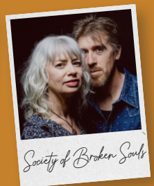
Society of Broken Souls

Be the first to hear about Goldfinch Room performances by signing up at center.iastate.edu/goldfinchroom . Dates vary monthly due to availability of space during the Stephens Auditorium Performing Arts Series season. The Goldfinch Room is located in Stephens Auditorium on the campus of Iowa State University. Tables are $40 and seat up to 4 people.