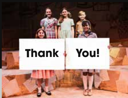
The Hundred Dresses, 2022-2023 Season