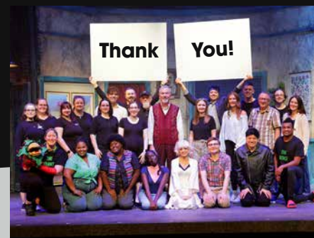
Cast of Little Shop of Horrors 2022-2023 Season.