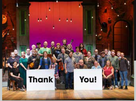
Once, 2023-2024 Season