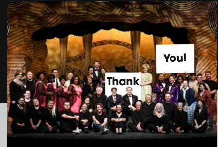
Cast of Beautiful 2023-2024 Season.