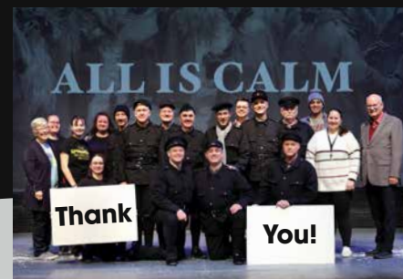
Cast of All is Calm 2023-2024 Season.