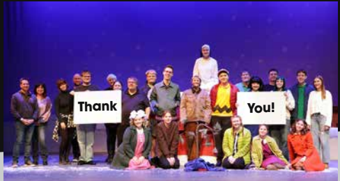
Cast of A Charlie Brown Christmas 2023-2024 Season.