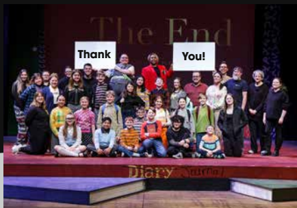
Cast of Diary of a Wimpy Kid 2024-25 Season.