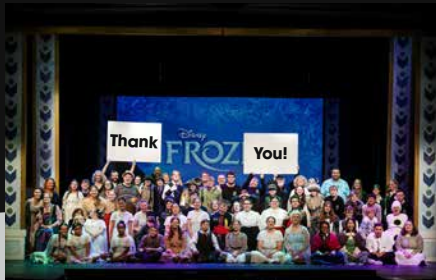
Cast of Frozen, Jr. 2024-2025 Season.